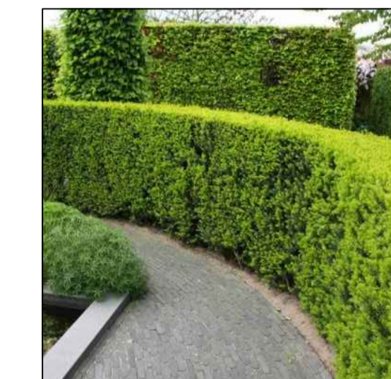
Curved Yew Hedge