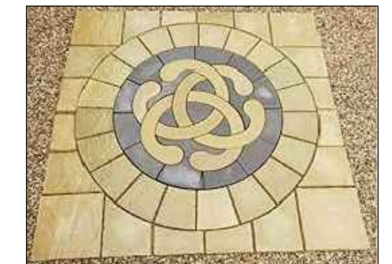
Entrance Feature Paving